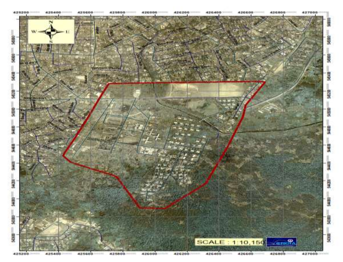
Figure 3: Map of CRUTECH, Calabar Campus